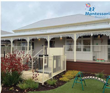
Front view of the Swanhill centre

Applying the ethos of child centered learning, which for the child is ‘help me do it myself’, Montessori Beginnings offers full or part-time learning and care services for children aged 6 weeks to 6 years. All children participate in a course of learning within age-specific groupings at Montessori Beginnings’ purpose-built facilities.