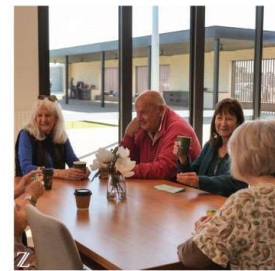
Making new friends and new memories with other residents