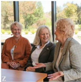
A group of residents enjoying an afternoon chat in the club house

At Zest Living, residents purchase a house at a price typically less than the median home price and lease the underlying house lot from Zest Living for an annual fee on a long-term basis. This realises cash savings from excluding the land purchase component while also offering community living benefits such as broad companionship and access to exclusive communal recreational facilities within a gated community setting.