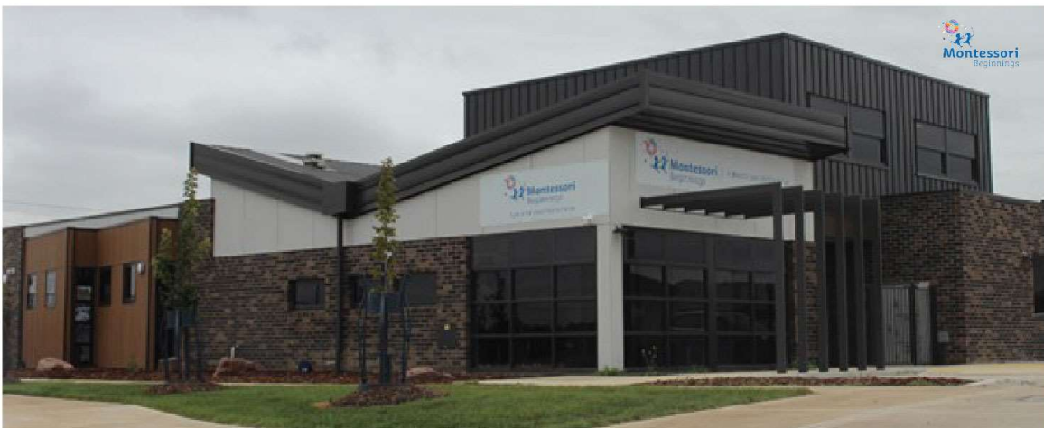
Outside view of the Greenvale centre