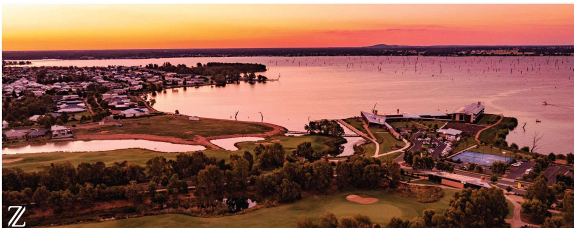
Picturesque lakeside at Zest Living Yarrowonga