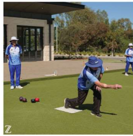
Modern lawn bowling facilities available on site