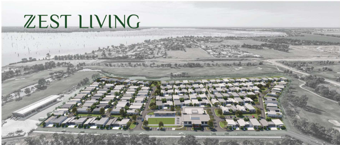
Artists impression of Zest Living Yarrowonga

Established to service either semi-retired or retired people wishing to downsize or liberate equity and stored wealth in their current home to fund their lifestyle aspirations. Zest Living aims to provide a financially viable solution to residential living in retirement by separating home and land ownership, a model popular overseas but is in its infancy in Australia.