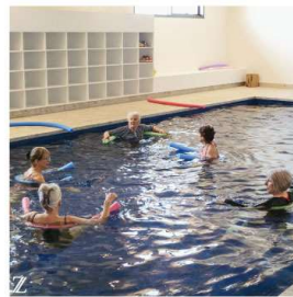
Monthly activities such as swimming lessons