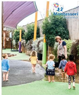
Little explorers on a big adventure