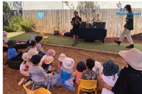
Igniting curiosity through a hands-on approach