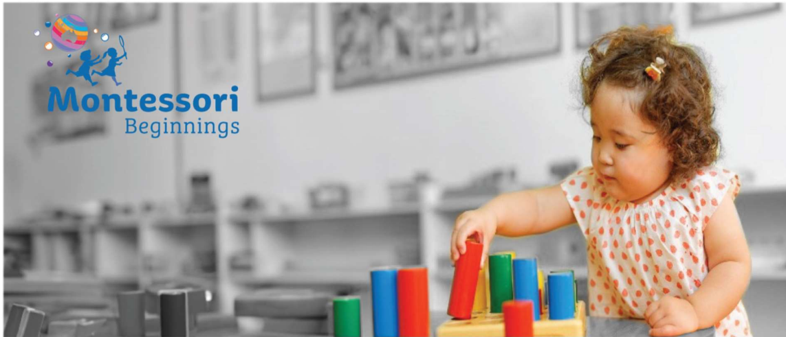
Toddler exploring and learning through block play

Established in 2018, Montessori Beginnings provides long day care childcare services utilising the ‘Montessori’ philosophy in teaching young children. The Montessori method, which is widely used in Western Europe and the USA, provides distinct choice for parents, enabling Montessori Beginnings to distinguish itself within the early learning and childcare sector.