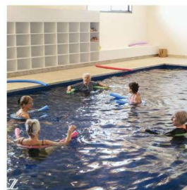
Monthly activities such as swimming lessons