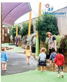
Little explorers on a big adventure