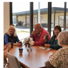
Making new friends and new memories with other residents