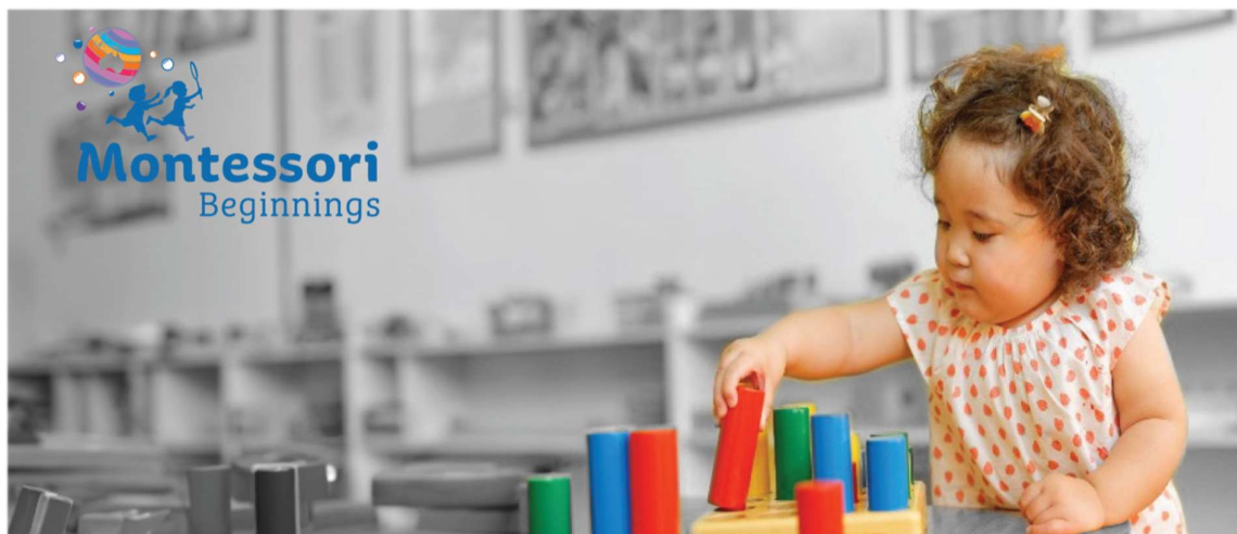
Toddler exploring and learning through block play

Established in 2018, Montessori Beginnings provides long day care childcare services utilising the 'Montessori' philosophy in teaching young children. The Montessori method, which is widely used in Western Europe and the USA, provides distinct choice for parents, enabling Montessori Beginnings to distinguish itself within the early learning and childcare sector.