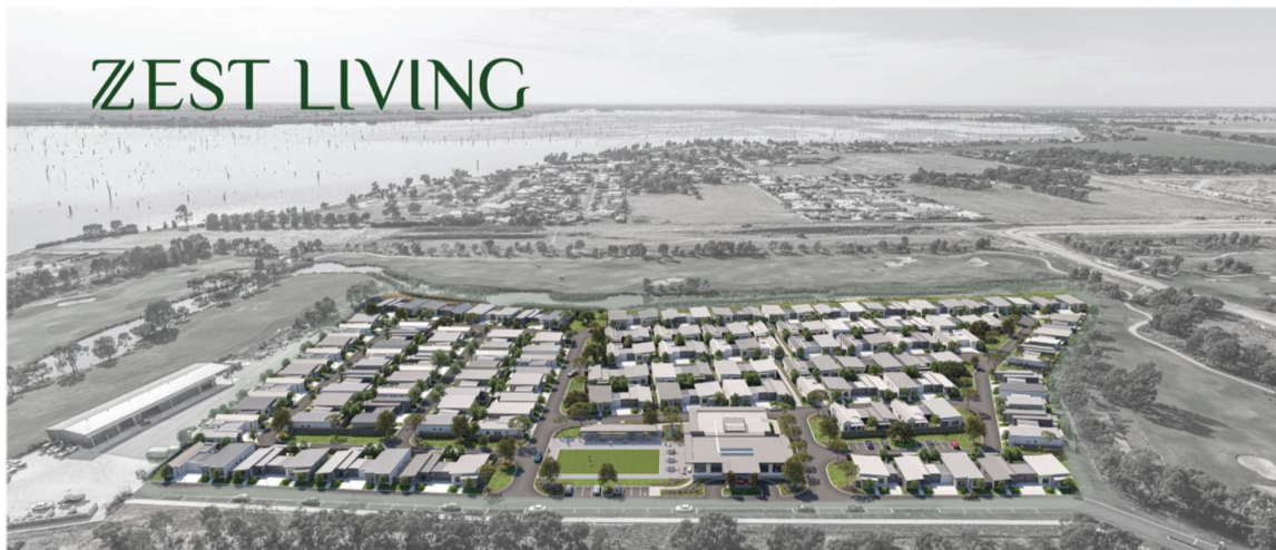
Artists impression of Zest Living Yarrowonga

Established to service either semi-retired or retired people wishing to downsize or liberate equity and stored wealth in their current home to fund their lifestyle aspirations. Zest Living aims to provide a financially viable solution to residential living in retirement by separating home and land ownership, a model popular overseas but is in its infancy in Australia.