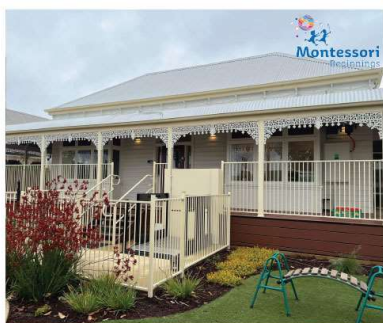
Front view of the Swanhill centre

Applying the ethos of child centered learning, which for the child is 'help me do it myself', Montessori Beginnings offers full or part-time learning and care services for children aged 6 weeks to 6 years. All children participate in a course of learning within age-specific groupings at Montessori Beginnings' purpose-built facilities.