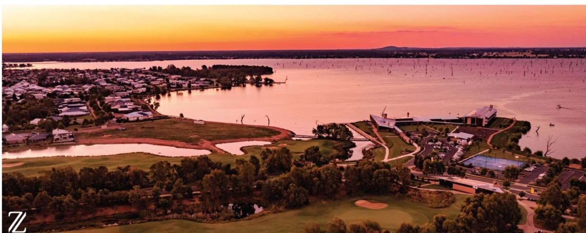
Picturesque lakeside at Zest Living Yarrowonga