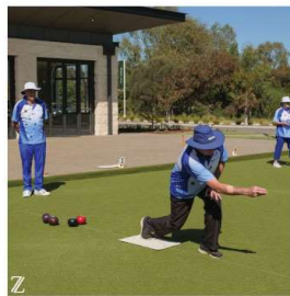
Modern lawn bowling facilities available on site