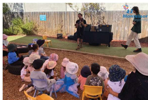
Igniting curiosity through a hands-on approach