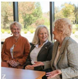
A group of residents enjoying an afternoon chat in the club house

At Zest Living, residents purchase a house at a price typically less than the median home price and lease the underlying house lot from Zest Living for an annual fee on a long-term basis. This realises cash savings from excluding the land purchase component while also offering community living benefits such as broad companionship and access to exclusive communal recreational facilities within a gated community setting.